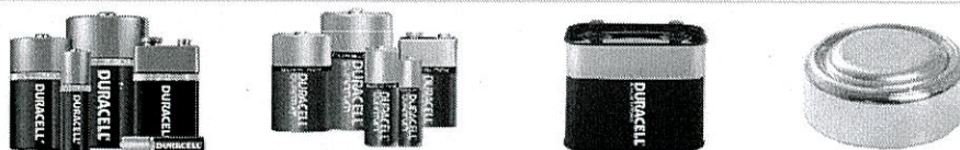
Major Cells Major Cells Lantern Specialty