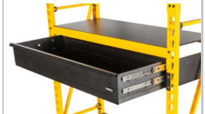
120 LB. DRAWER CAPACITY