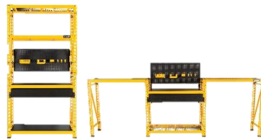
BUILD UP. BUILD OUT.™