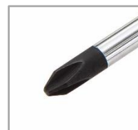
BLACK OXIDE TIP