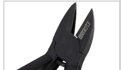
NAIL GRABING CAVITY