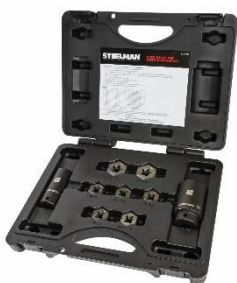
BMC STORAGE CASE