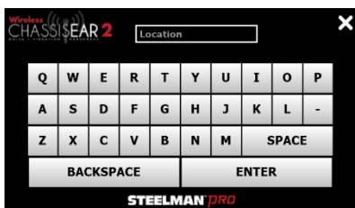
CUSTOM LOCATION NAMING FOR TRANSMITTERS