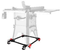
TABLE SAW CONFIG