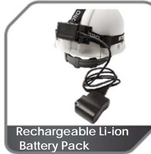
Rechargeable Li-ion Battery Pack