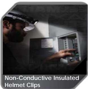
Non-Conductive Insulated Helmet Clips

OSHA approved non-conductive, insulated helmet clips secure Headlamp to hard hats Rated for 600V (Patent Pending)