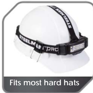
Fits most hard hats