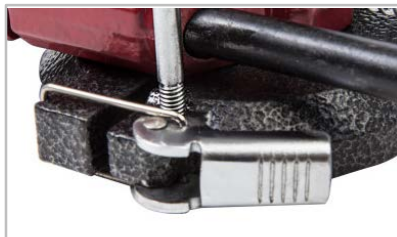
CLASP UNLOCKS VISE