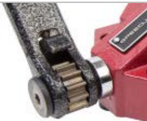
RATCHET FOR FINE GRIP

360 DEGREE SWIVEL BASE Precision machined disc offers more precise rotation