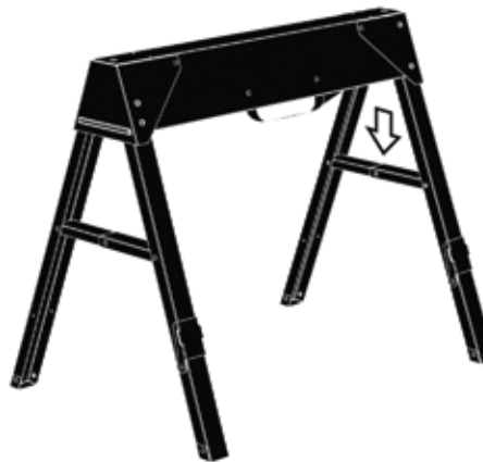
5 STRAIGHTEN THE CROSS BRACE