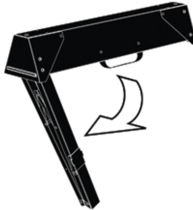
2 FOLD OUT THE 1 ST SET OF LEGS