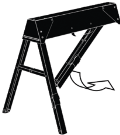
4 FOLD OUT THE 2 ND SET OF LEGS