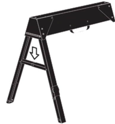
3 STRAIGHTEN THE CROSS BRACE